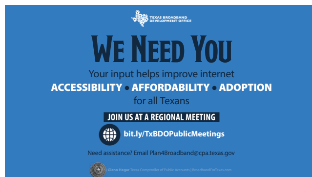
Sample Twitter Ad