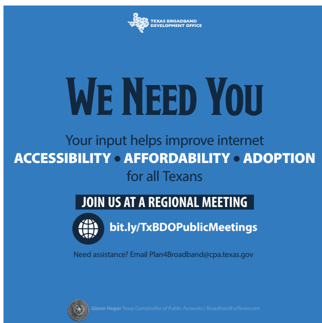
Sample Facebook Ad

The social media posts below can be tailored to your audience with local details about the meeting.